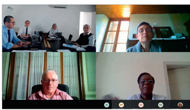
Steering Committee of 20 May 2020 by video-conference

For example, in Yaoundé, where some congregations have been badly affected by Covid 19, the Central Africa section has been particularly active in supporting them!