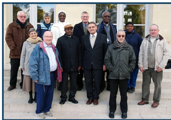
IMS Steering Committee